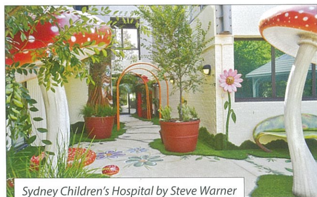
Sydney Children's Hospital